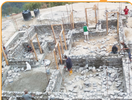
Construction of our 4th Health Post and Birthing Center in Baspani. April 2019.