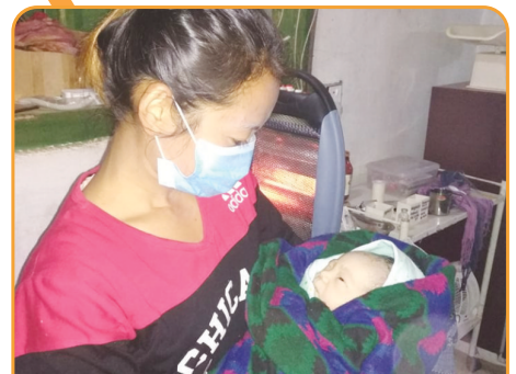
A delivery at Sapteshwor Health Post and Birthing Center.