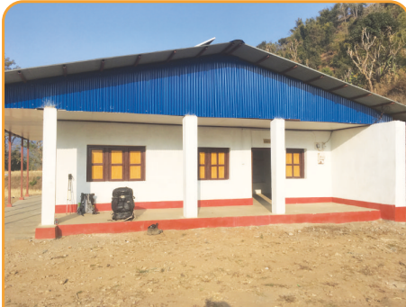
Our newly-constructed Health Post and Birthing Center in Sapteshwor.