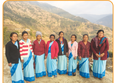
Female Community Health Volunteers (FCHVs) provide local women their first-exposure to our health posts and birthing centers.