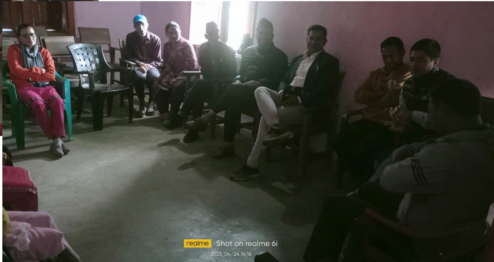
Meeting at Hauchur