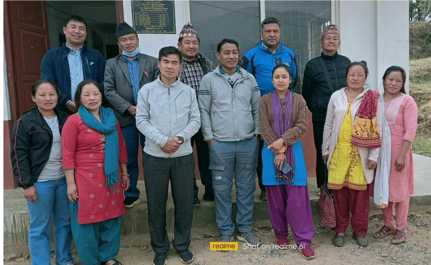
Meeting at Patheka