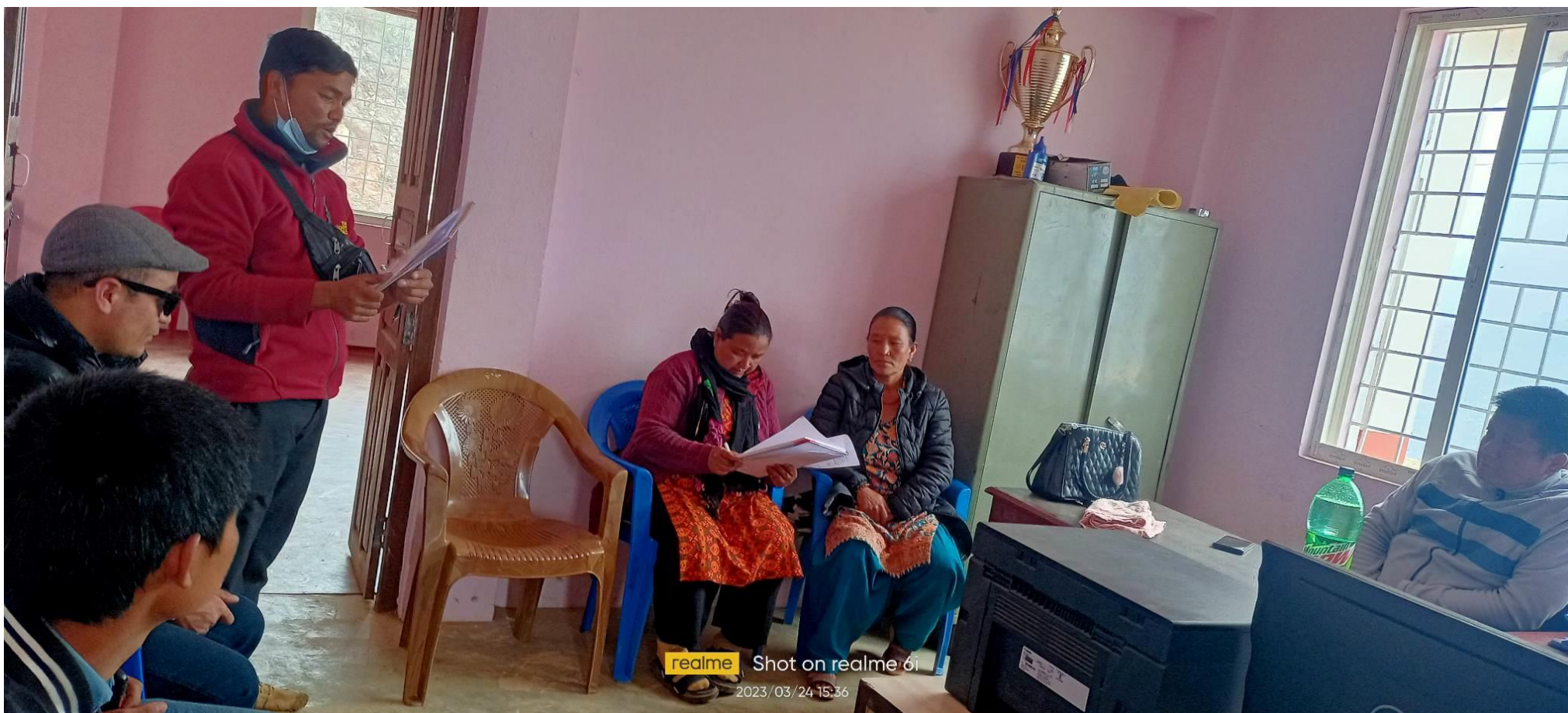
Meeting at Kharmi